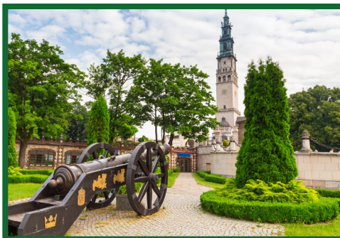
Jasna Gora Monastery, Warsaw