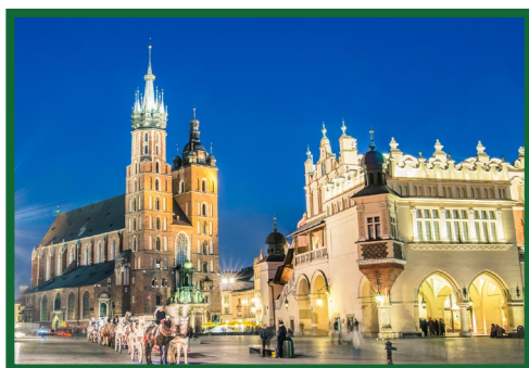
The Main square, Krakow

Transfer to Krakow Airport for your return flight home, taking with you memories of Poland's warm hospitality and rich history. (B)