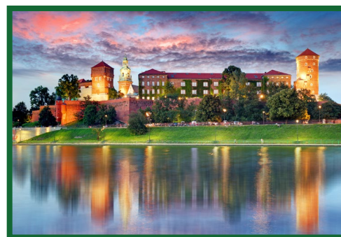
Wawel Hill, Krakow