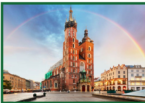
St. Mary`sChurch, Krakow